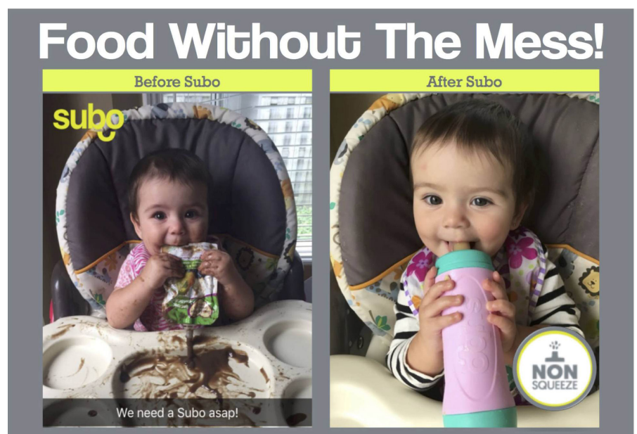
Subo is a re-useable food bottle that helps children as young as 6 months to feed themselves.

Unlike the one billion squeezeable pouches that end up in global landfills every year, Subo is re-useable and mess free: "Imagine being able to feed kids yogurt when you're out shopping without having to clean up a mess," says Glen.