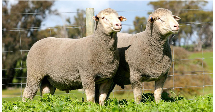
Handsome dudes ... only Australia's finest rams, including this pair of Dohne sires, make the grade for RamSelect Plus.

The Sheep CRC's next app project will be to develop a tool to provide local alerts across Australia on risks to sheep wellbeing such as flystrike, parasites and extreme weather events like cold stress during lambing or after shearing.