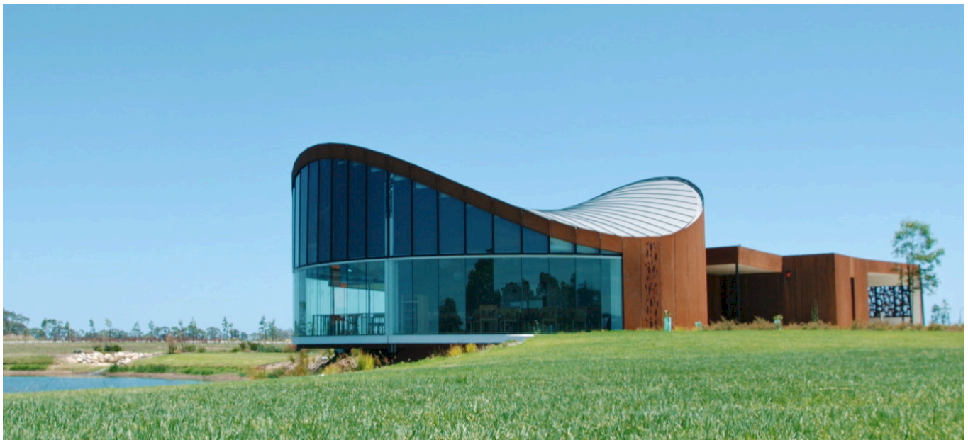
TILT's innovative work was used in the design of Bunurong Memorial Park in Melbourne

Entrepreneurs' Programme helps TILT employ 10 new staff in just two years