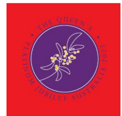
Do not use a block of colour