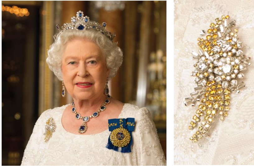
Her Majesty The Queen's Wattle Spray Brooch

It inherits the illustrative traits of the current logo featured in the Official Queen's Platinum Jubilee Emblem. The Golden Wattle is Australia's national flower and the dominant icon on the logo, and therefore has a strong influence on the colour palette. The golden yellow colour swatch complements the royal purple of the United Kingdom led branding colour scheme.